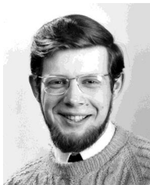
Figure 3 Bob Chivers, Pioneer of tissue scattering physics – basis for most modern tissue characterisation

From the early days there was an awareness that tissue echoes could provide specific, diagnostically useful information, beyond just a relative amplitude. One of the first attempts at systematic measurement, by Mountford and Wells [(14)], was to quantify echo levels relative to that from a perfect reflector. A rather different approach was an exercise in the physics of scattering, in broad analogy to x-ray diffraction. First to tackle this was Chivers [(15)], whose work led to investigations, by Bamber and Dickinson, of the nature of the coherent scattering that had been a feature of all ultrasonic images [(16)]. This in turn led to ideas for eliminating speckle noise from images, and also, whether by speckle tracking or otherwise, extracting rheological properties of tissues (“remote palpation”) – the process that has subsequently developed widespread use as Elastography [(17, 18)].