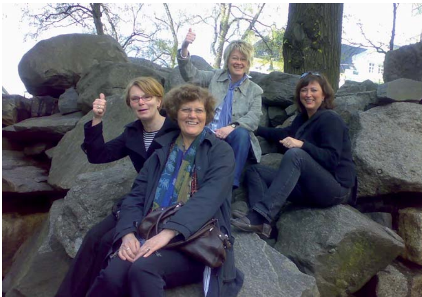
NFUD goes its own way